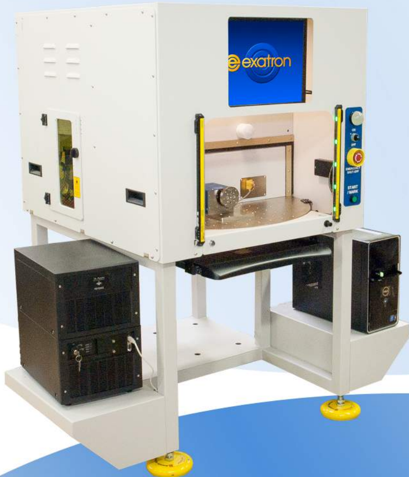
Model 632 Laser Enclosure, OEM PC, and Laser Power Supply